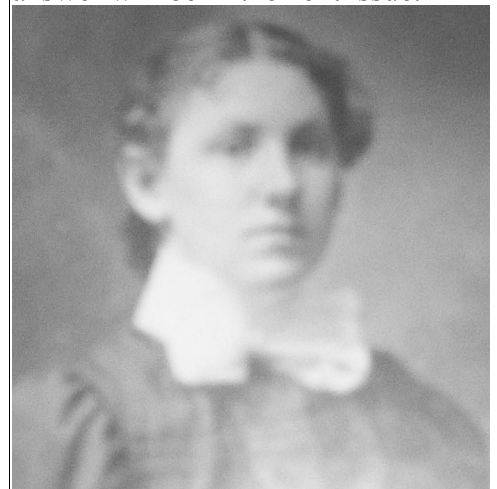
Hint: She was a Perry teacher in a one room school house.

We know who she is. Do you? The answer will be in the next issue.