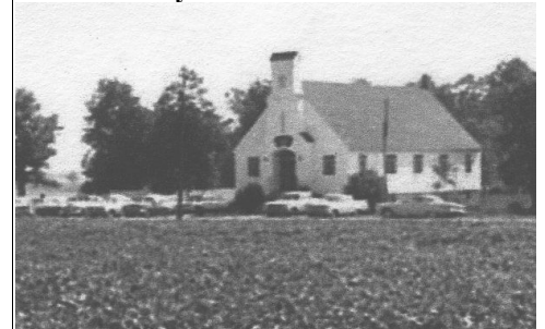
Photo of Olive Chapel from Amherst Road (Late 1950's, early 1960's)

Right over there, was our little church by the side of the road. The sun would come up and people would don their 'Sunday Best' clothes to gather and worship their true Lord and Saviour.