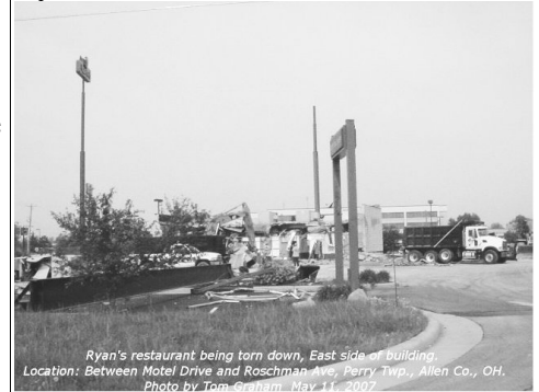
Ryan's restaurant being torn down, East side of building. Location: Between Motel Drive and Roschman Ave, Perry Twp., Allen Co., OH. Photo by Tom Graham May 11, 2007

The view along Greely Chapel Road is changing again. Ryan's was torn down on May 11, 2007. Ryan's was located between Motel Drive and Roschman Ave.