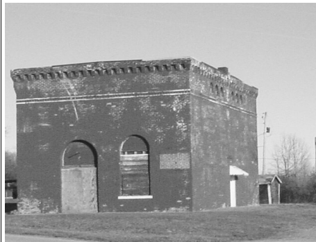
Photograph by Tom Graham, April 20, 2007

At the corner of Greely Chapel Road and Hanthorn Road is one such substation.