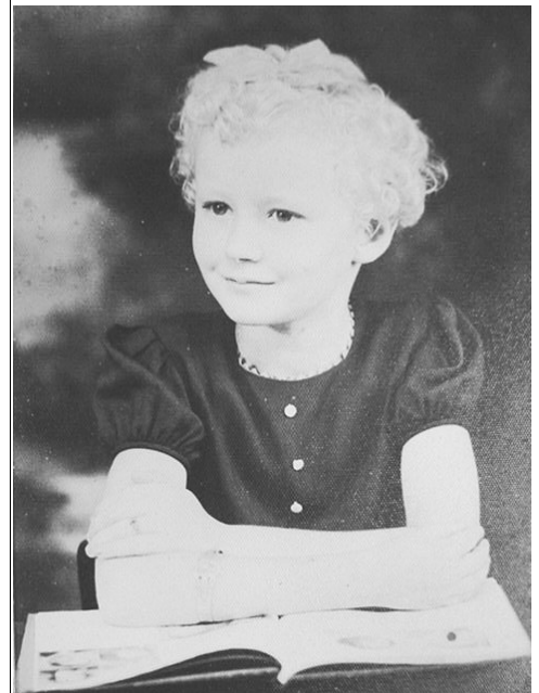
Hint: She was a librarian at Perry.

We know who she is. Do you? The answer will be in the next issue.