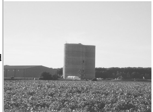
July 21, 2007

The Lima Ethanol Plant is being constructed and is expected to be producing ethanol before year end. It is located on the north side of Hanthorn Road, between I-75 and St. Johns Road. The historical society will have a detailed report about the plant in the next issue.